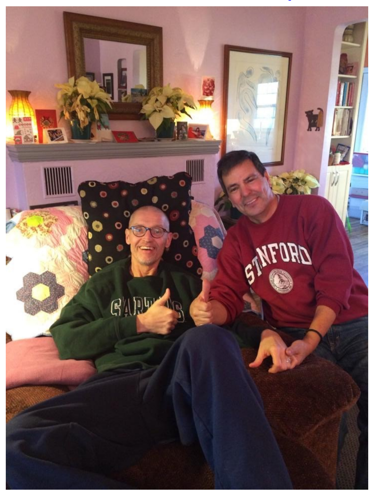
Case 1:18-cv-00603-RB-KRS Document 24-1 Filed 12/13/18 Page 23 of 23