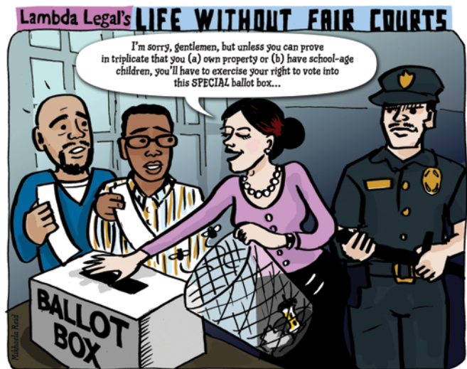
Protect Your Rights — Stand Up For Fair Courts! • www.lambdalegal.org/courtingjustice

“It is almost an obscenity that the [New Jersey] Supreme Court would seize unto itself the power to order the legislature to create legislation... That kind of activism requires a reply. This is not a government of appointed justices.”