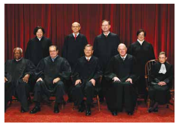
Lambda Legal weighed in on two important cases before the U.S. Supreme Court about religious exemptions in health insurance.